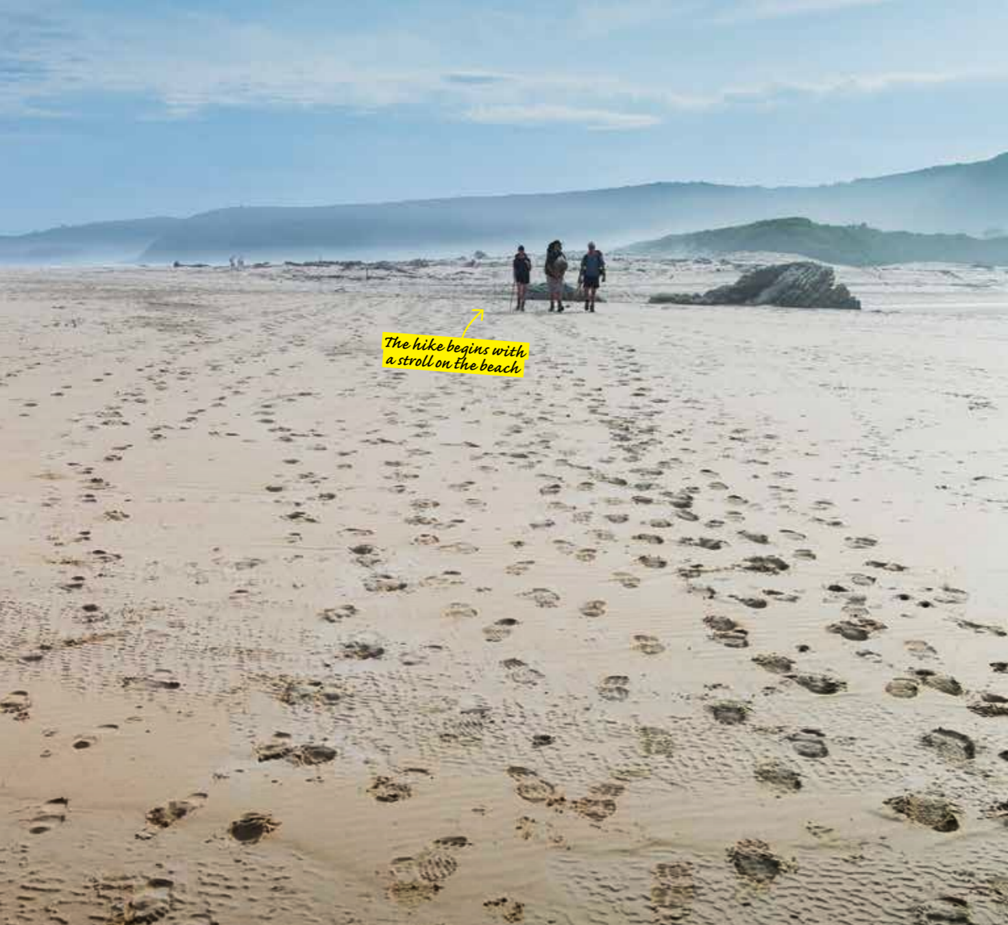
The hike begins with a stroll on the beach